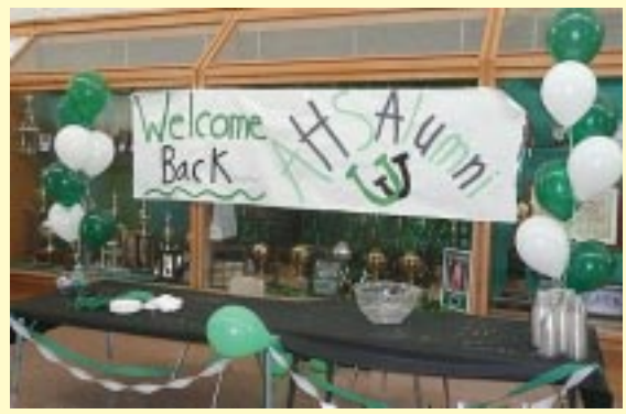
For the first time, Student Council held the Exes reception in the foyer of Gym A.