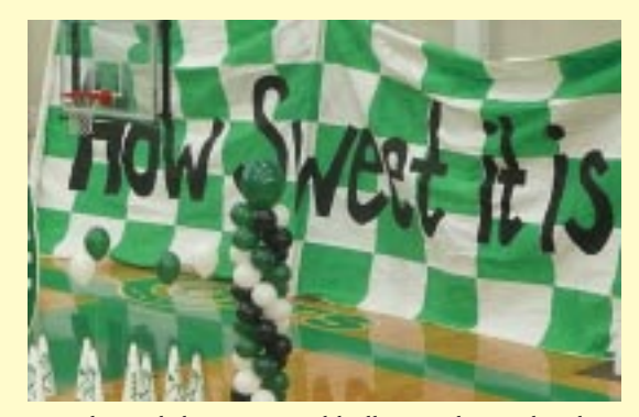
Run-through banners and balloons showed Colt Spirit, Pride, Tradition.