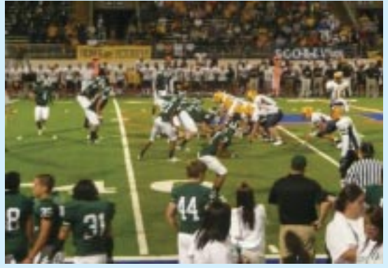
Hurrah for the 2009 Colts who had a playoff run to the Regional Finals!