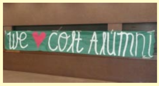
The Exes reception welcomed all Alumni.