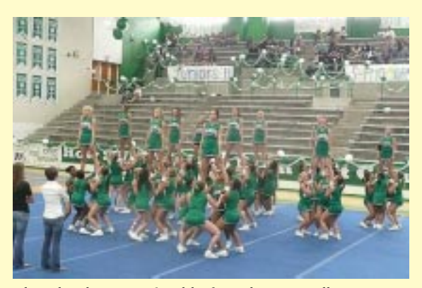
Cheerleaders practiced before the pep rally.