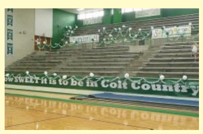
The gym looked good.