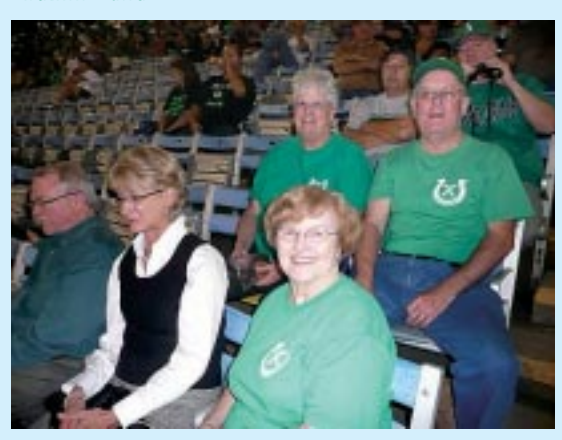
Distinguished Colts enjoy the game with family.