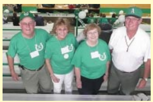
Distinguished Colts for 2009 were recognized during the pep rally.